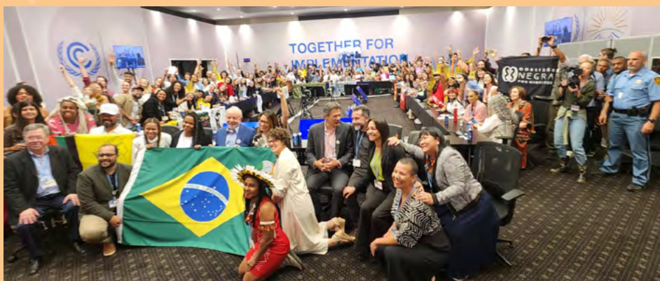
Brazilian youth together with President-elect Lula for delivery of the Youth Charter

Access here the full letter of youths in Portuguese.