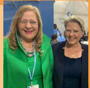
With Minister of International Development of Norway Anne Beathe